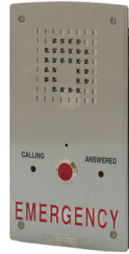
NFPA 72 Compliant Call Station