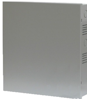
Class 2 Power Supply with Enclosure for HON-AOR-5 and HON-AOR-10 Command Units