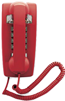
Sub-Command Unit for HON-AOR-5 and HON-AOR-10 Command Units

Support accessories for Area of Refuge or Area of Rescue Assistance (AOR) systems range from flush mount trim rings to sub-command units to a cellular gateway.