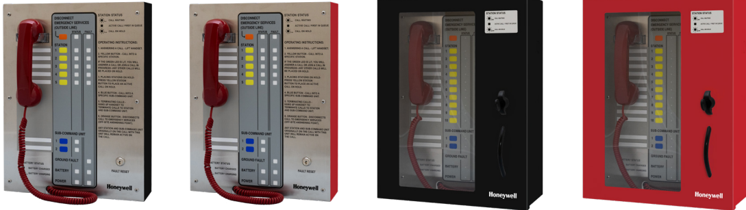
5- and 10-Station Command Units – UL 2525 and NFPA 72 (2022 Edition) Compliant