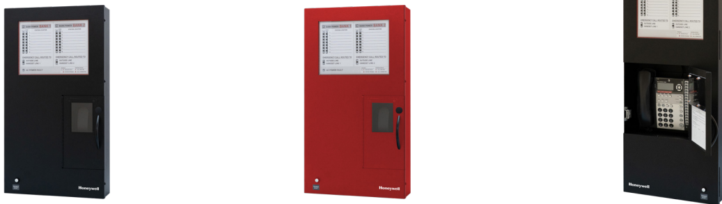
16-, 24-, and 32-Station Command Units – NFPA 72 Compliant