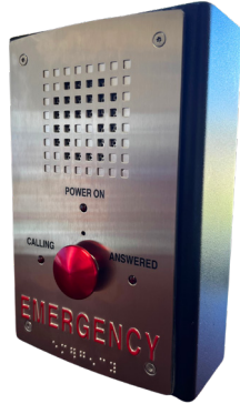
UL 2525 Listed Call Station

AOR call stations provide hands-free, ADA-compliant two-way emergency communication endpoints for calling a constantly attended Command Unit or to an approved off-site answering point.